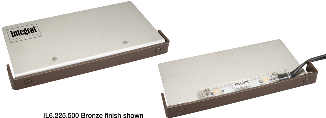
IL6.225.500 Bronze finish shown